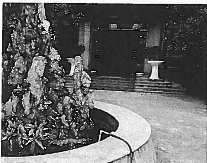
Photo of a clinic in Hanoi, Vietnam

We have updated A Guide to World Services in NA (GWSNA) for the 2016–2018 Conference cycle to reflect decisions made at WSC 2016. We sent a notice to Conference participants of a 90-day review on 20 December 2016. We are asking you to send any input on this draft by 15 March 2017. The draft has been posted to the Conference participant FTP site and the final version will be posted online after any revisions.